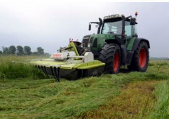
The farmers leasing land from the district in the bird sanctuary have to comply with strict rules. The Mittermeier farming family has no problem allowing for ground-breeding birds. If the spring swathes are mowed in wavy lines, the chicks can hide better.

J ochen Späth's years of supervision and cooperation are now bearing fruit. That is the recipe for success for the positive development of ground-breeding birds in the Königsauer Moos.