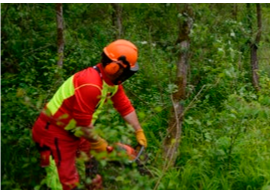
The grey alder resprout after coppicing to create a pioneer forest.