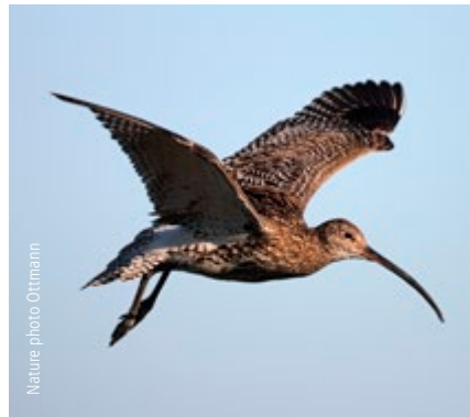
Nature photo Ottmann